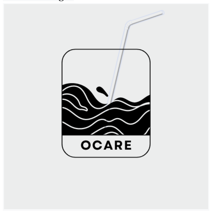
This is the logo: